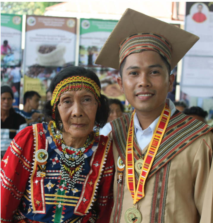
A proud mother with her son on graduation day at Pamulaan.

"Look around you, a world of strife. Shall we let it go on and on? Together, we the youth and our elders, we will build a lasting peace for all, rich and poor. Now is the time to unite for peace."