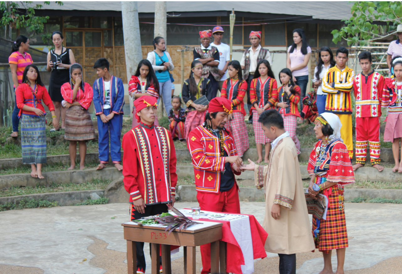
A graduation ritual being performed at Pamulaan, where an elder marks the graduate’s hand as a blessing.

Who are the indigenous peoples, the “IPs” of the Philippines, and why do their songs and poetry express yearnings for peace? As of the latest available census in 2007, IPs consist of about 16