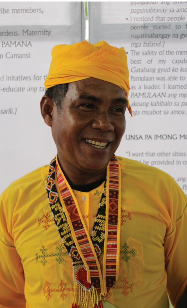
An IP elder who is now a fellow of the IP LED program.

Since 2007, the Pamulaan Center conducted an annual national kalindogan or “gathering” of different tribes to celebrate and sustain their culture. Students participated actively in discussing community concerns and planning “culturally rooted and peace-promoting” responses to these. In 2010, for example, the concerns were about climate change adaptation and disaster preparedness and management. To date, the Pamulaan Center has organized seven congresses attended by national leaders, local officials, and donor partners. The partners have shared in the responsibilities of convening the event, with Assisi Development Foundation as the organizing committee head. As a consciousness-raising activity on current and relevant issues faced by IP communities, the event is also a leadership exercise for Pamulaan students who are organizers of the solidarity nights, with around 300 youth leaders and elders from 40 tribes all over the country in attendance.