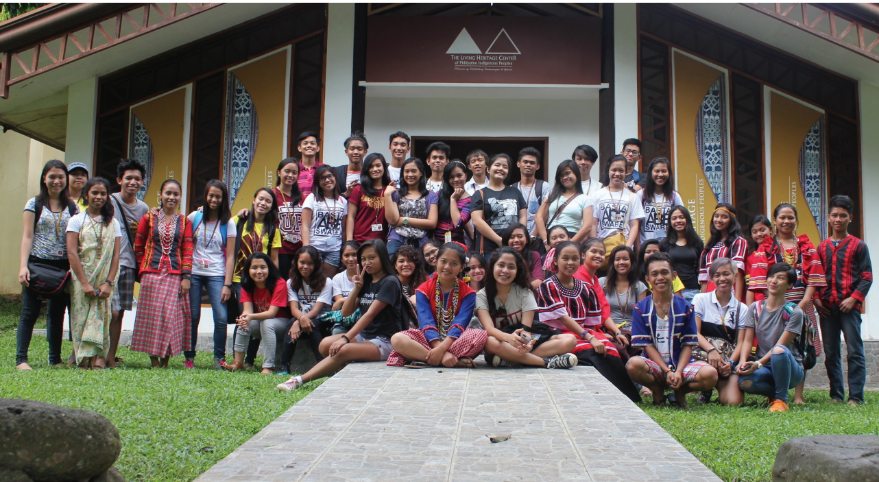
Pamulaan students outside of the Living Heritage Center.