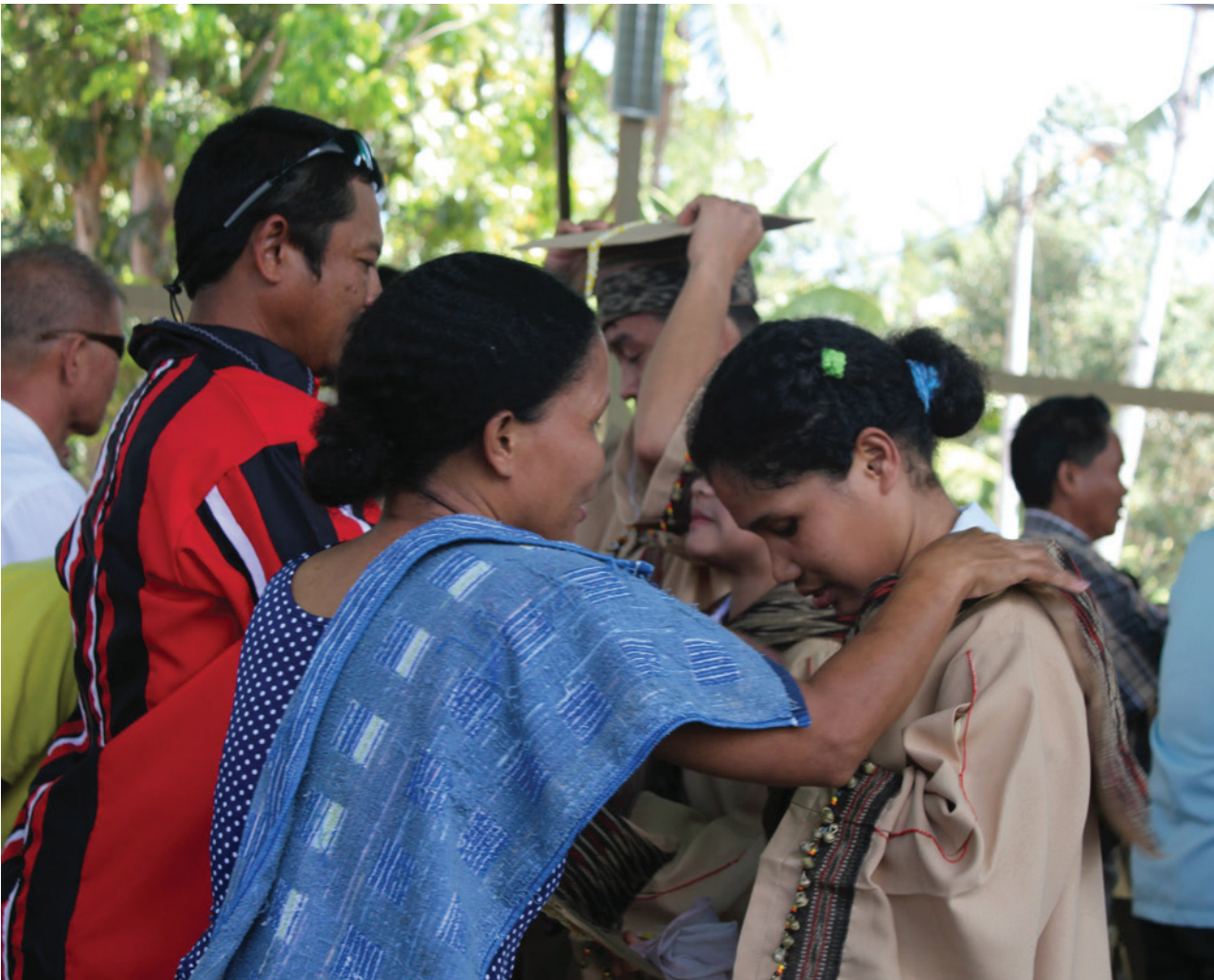
Graduates receive congratulations from their parents.