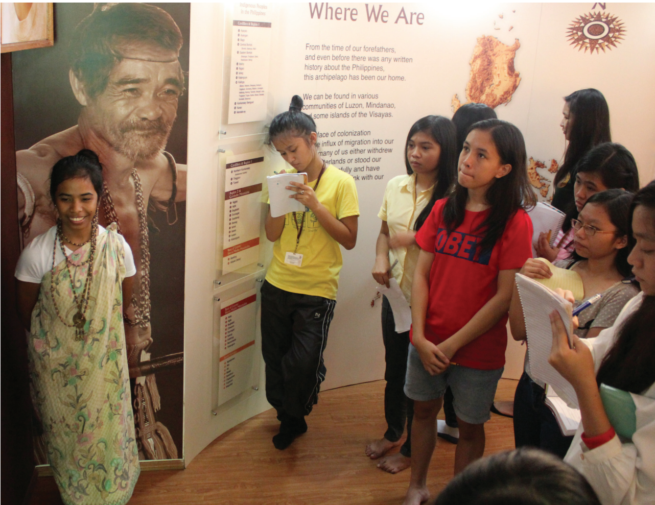
A student guides visitors inside the Living Heritage Center.

Classes opened at Pamulaan in 2006 to great acclaim. A columnist for the national broadsheet